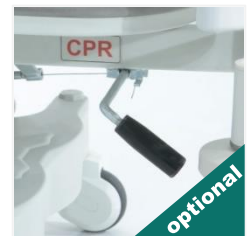
Dual Sided Manual CPR at Backrest