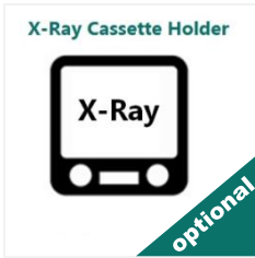
X-Ray Cassette Holder at Backrest