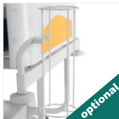
Oxygen Cylinder Holder