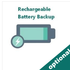
Rechargeable Battery Backup