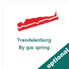
Trendelenburg by gas spring