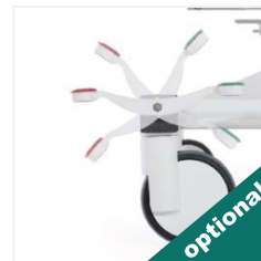
Central Brake Castors 150mm