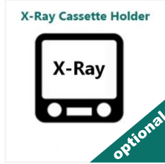
X-Ray Cassette Holder at Backrest