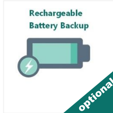
Rechargeable Battery Backup