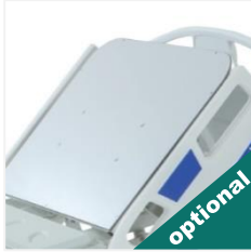
X-Ray Translucent HPL Backrest