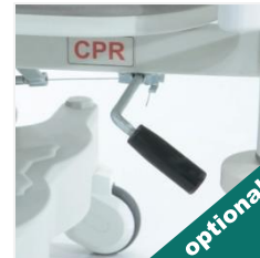
Dual Sided Manual CPR at Backrest