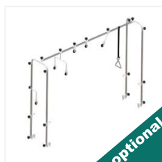
Orthopedic Traction System