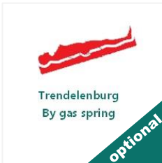
Trendelenburg by gas spring