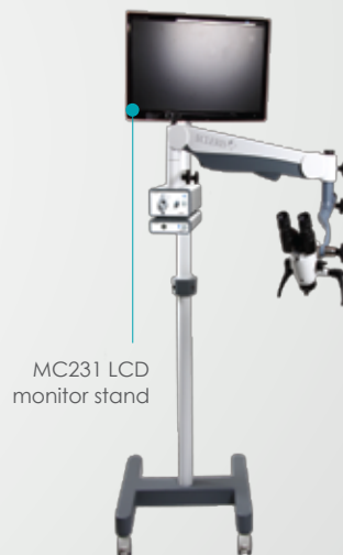
MC231 LCD monitor stand